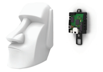
Custom case 3D model file and instructions are provided on routerboard.com.